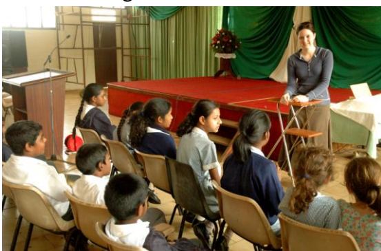
Lessons on Joseph

During the week we were able to do devotions and Bible studies with the students of the Jivannadi Mission School. The children were incredibly responsive to the lessons, which made teaching easy (and leaving at the end of the week difficult!) Wednesday morning I was able to spend time with the older girls. While I always enjoy teaching young ladies, the Jivannadi girls' persistence in seeking the Lord made teaching them a real pleasure.