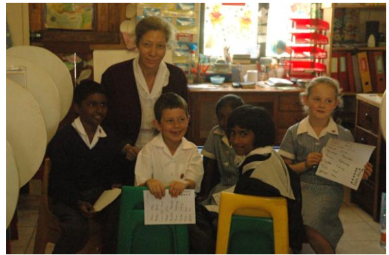
The Jivannadi first grade class

At Livingstone House, the Frontline HQ in Cape Town, I have a variety of responsibilities and training opportunities. I am the administrator of the William Carey Bible Institute ( www.williamcareybi.com ), which includes correspondence, literature dispersal, and assignment management. Through WCBI, I am able to correspond with pastors from all over Africa including South Africa, Zambia, Namibia, Cameroon, Malawi, and Nigeria, to facilitate their theological training. I also administrate the