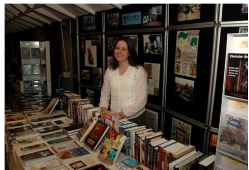
The Frontline Fellowship book table