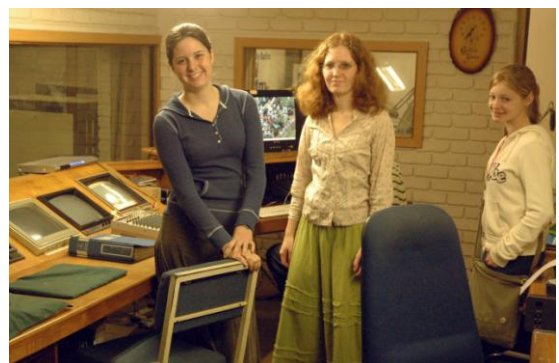
Inside the GNCR broadcasting center