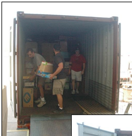
Thank you to each person who helped pack and load all the materials into the container. Moving 35,000 lbs is no small project, especially in the Phoenix heat!

We are expecting the container to arrive in Zambia in late October. Before it reaches us, it must not only pass over land and sea, but also through many hands, all eager to have a share of the materials inside. It can sometimes be difficult to clear the various government agencies when importing goods. Because Africa is riddled with both poverty and corruption, a container full of books and supplies is a great temptation to some of the officials who will be processing the container through the borders.