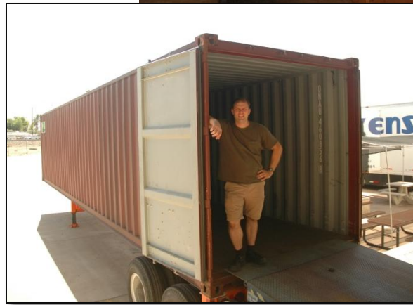
A 40ft shipping container can hold almost 2300 cubic feet of material. That is a lot of Bibles and school supplies! Our container weighed over 35,000lbs after we loaded it!