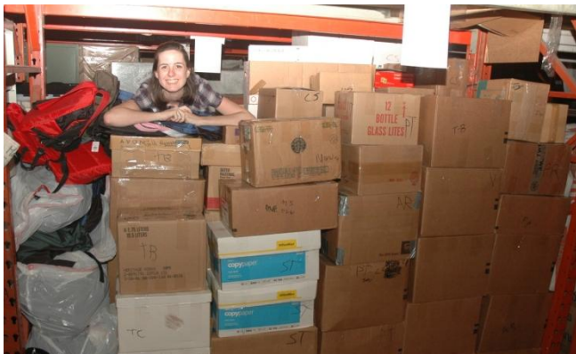
I never imagined that we would have such an incredible response. Thank you for sending us your Bibles and supplies, for praying for us, and for supporting us in this project!