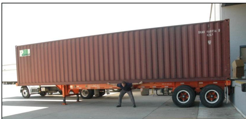
The challenges involved in collecting and shipping Bibles and supplies to Africa seemed truly overwhelming.