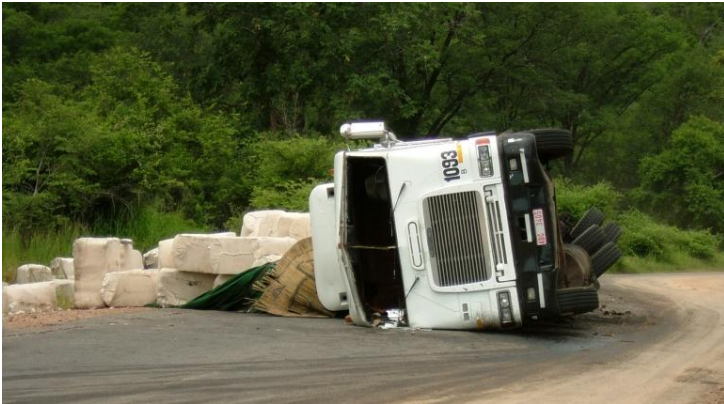
Poor road conditions + dilapidated vehicles + bad drivers= big messes

rolled off the road, resulting in what I have dubbed, "an African Twisty Truck" (not at all a rare sight on African roadsides). It sat, or rather languished, there on the side of the road until it was later picked up by another truck to continue on to Sudan. When the driver reached the border at Sudan, he watched other trucks leaving the country, their sides riddled with bullet holes. He abandoned the container there at the border, never notifying us of its whereabouts. After a great deal of investigation, we finally found the container at the border, sourced yet another driver, and continued through the Sudanese border to Lui. Once we arrived in the village, the container had to be pulled off the back of the truck and dropped to the ground with chains anchored to large trees. We finally got to open the container and take out our materials. Well, after the general shipment unsettling, rolling off a trailer and down a hill, sitting in poor weather conditions,