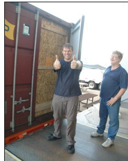
"We're done packing!!!!"

Please pray that our container will pass safely through the borders and customs agencies.